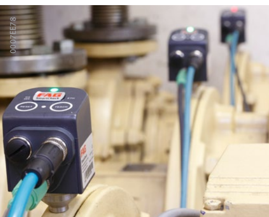
Pump monitoring with FAG SmartCheck