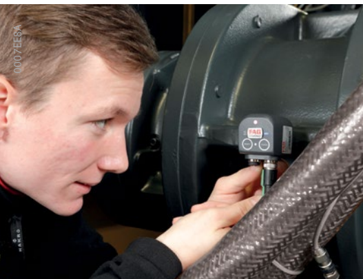
Easy installation and commissioning